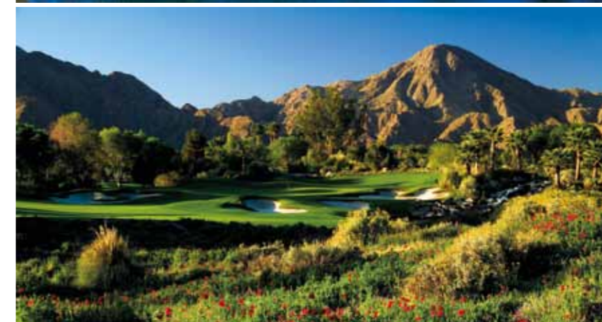
OPENING PICTURE: 1 st Hole. BOTTOM RIGHT PAGE: Celebrity Course 16 th hole.